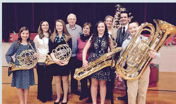
MVK students hold new band instruments purchased with grants from Foundation funds.

Can you give to your favorite charities without going through the Community Foundation? Absolutely. But there are times when it is beneficial to use our services: 1) Maybe you've had a high income year. You can off-set your tax burden by starting a fund with a large amount and then granting it out in smaller increments over time, taking the tax deduction at the front; 2) You want to leave a legacy. You can trust the Foundation to adhere to your wishes after your lifetime. You can even allow your children and grandchildren to make grants decisions!