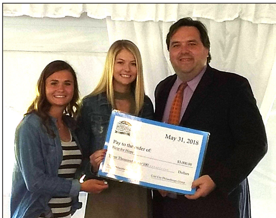
Coal City “Young Philanthropists” present a grant check to Help for Hope.

Regardless of whether our county’s youth are struggling, learning, creating, or wanting to make a difference, these recent endowments are allowing us the flexibility to design grants and programs to address them all!